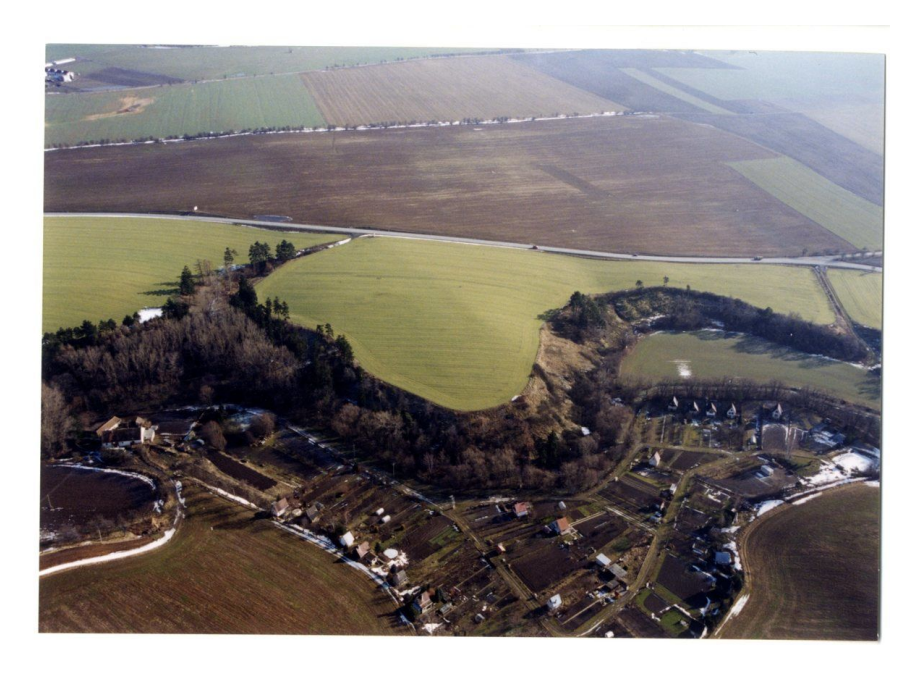
Aerial view of the hillfort from the west.