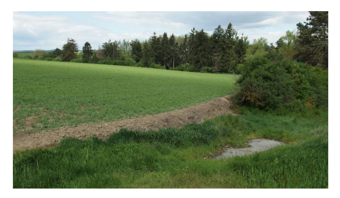
View of the hillfort area from the east.