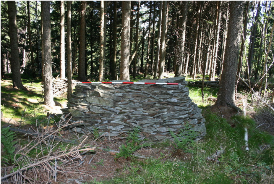
Circular building on the slope of the Velká Stříbrná hill.