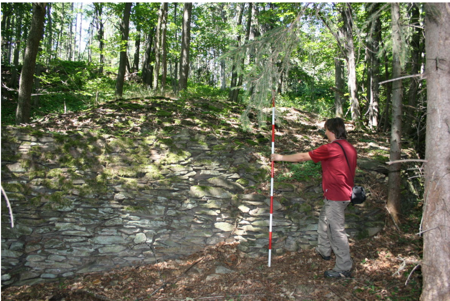
Agricultural building in the surroundings of Ďáblův kopec.