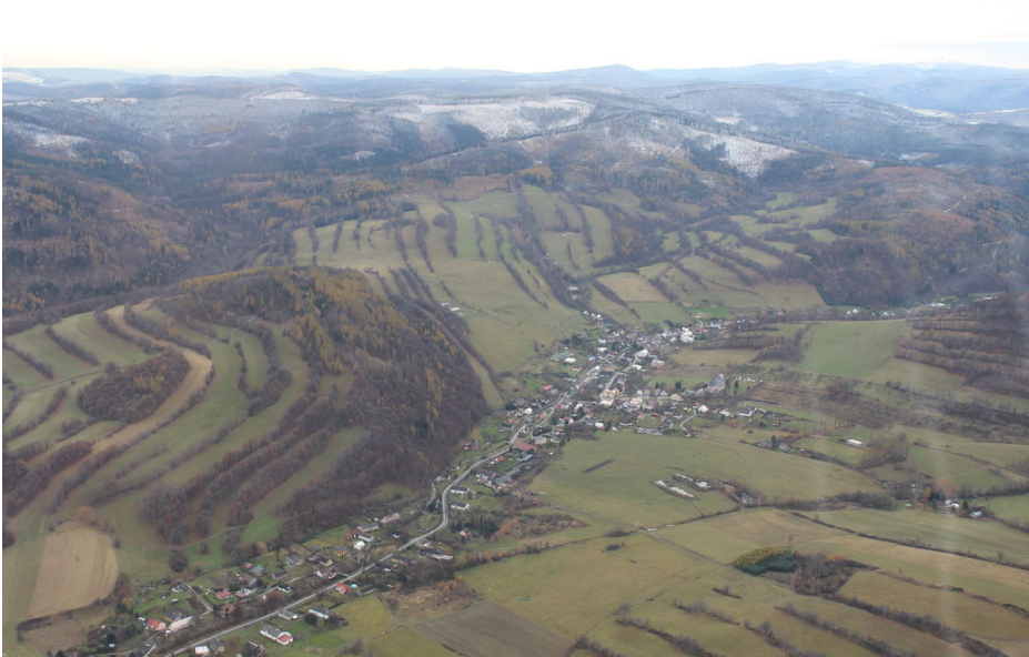
Physical relief in the surroundings of Janov, aerial view from the north-east.