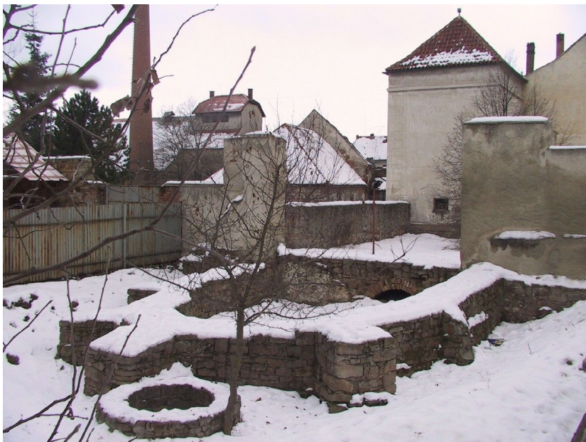
Foundations of the presbytery and a well uncovered during the archaeological excavation.