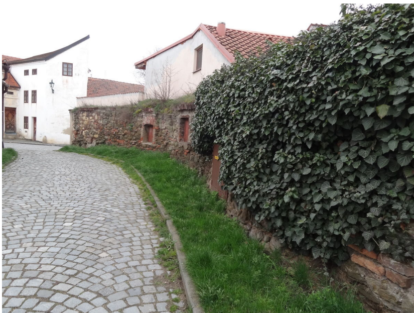
City wall with the remains of the Nová brána ('New gate') incorporated into a residential building.