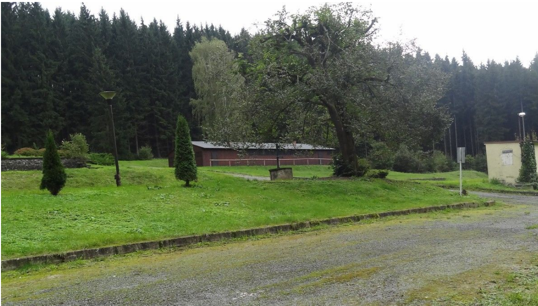
The area of the camp with the preserved barrack No. 3 and a well before general renovation. Photo A. Knechtová, 2014.