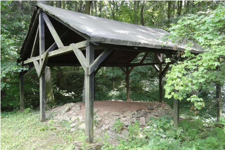
Pottery kiln in the south-south-eastern corner of the manor house.