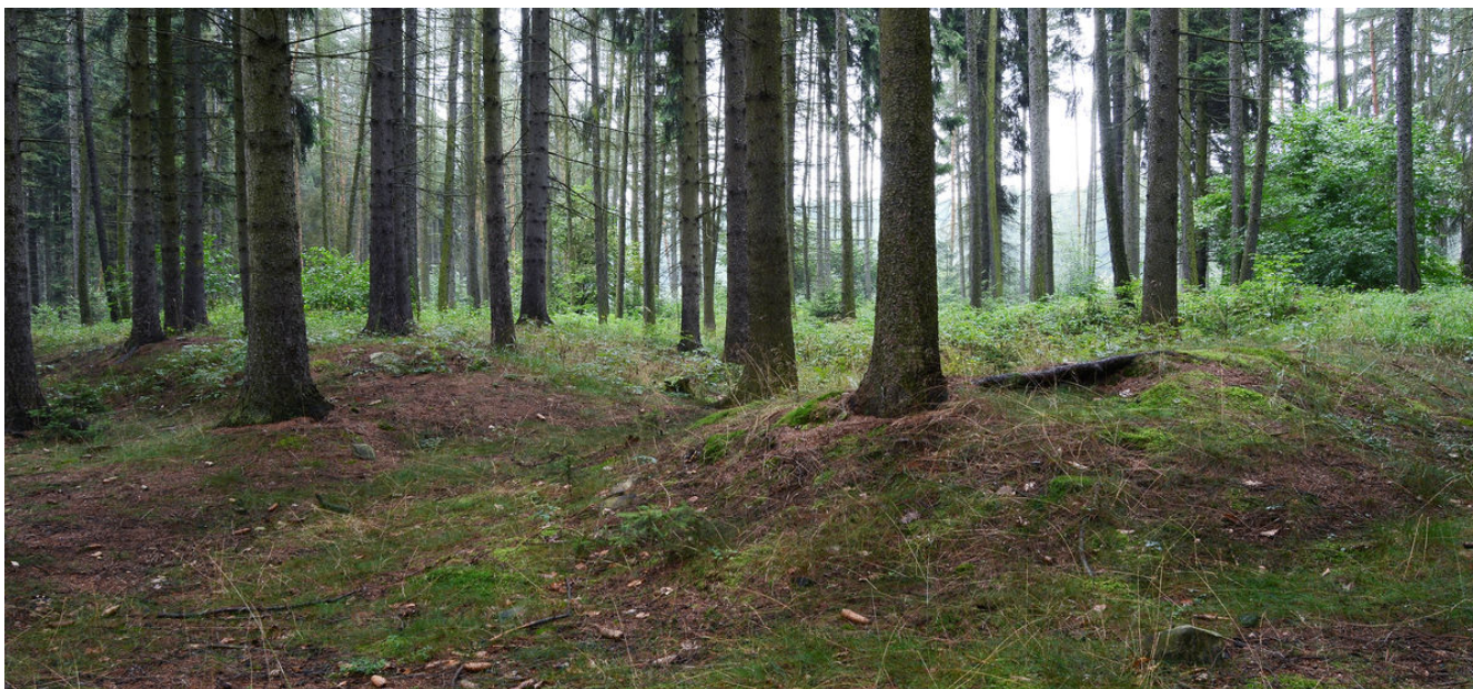
Surface in the deserted village.