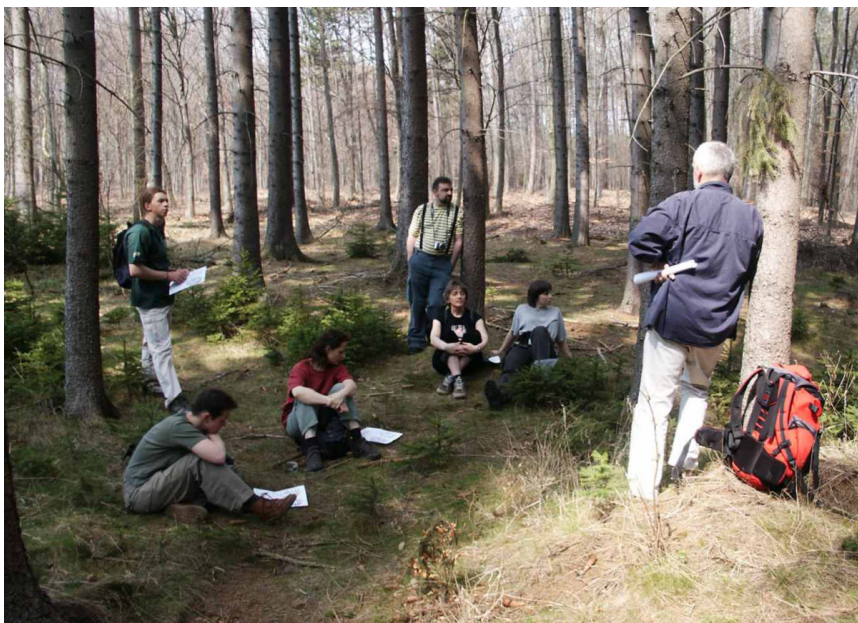
A visit on the site.