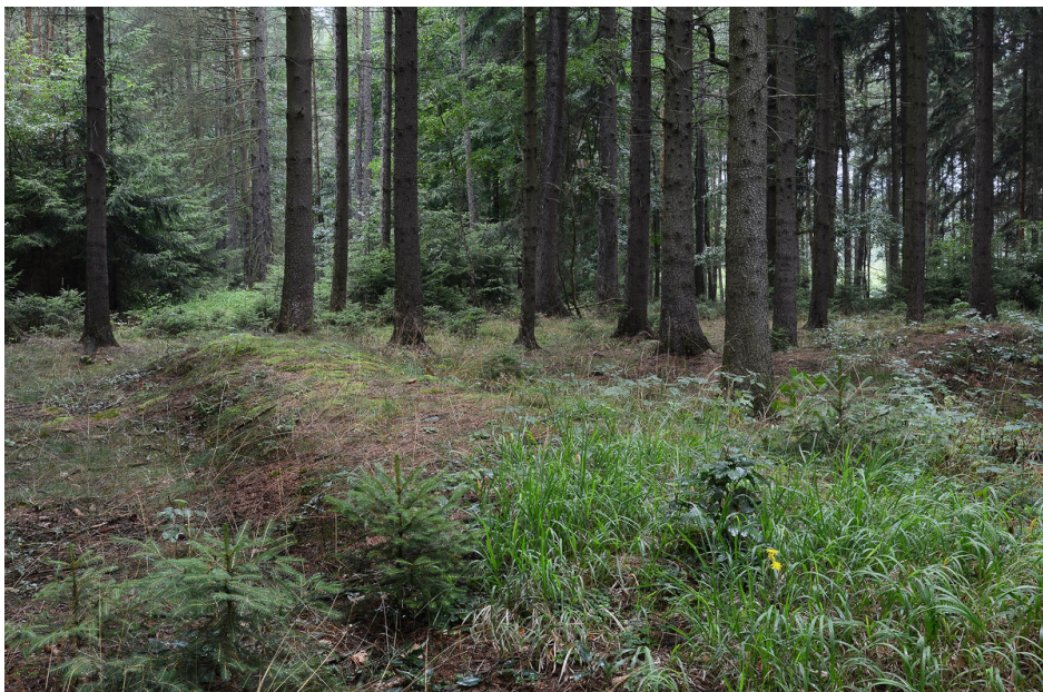
Medieval deserted village ruins.