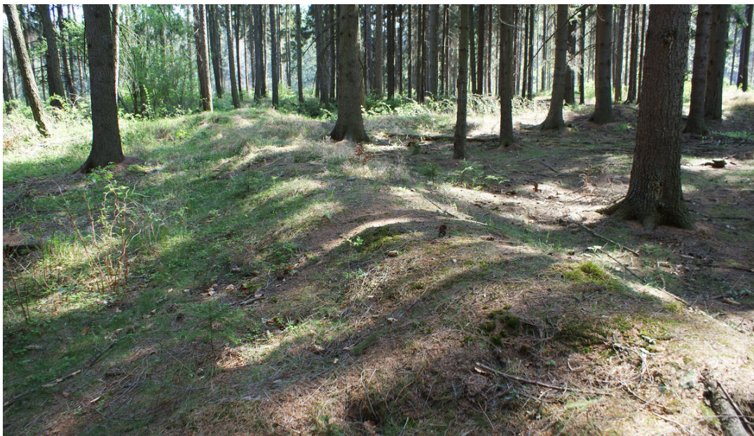
Homestead Nr. 14, walls.