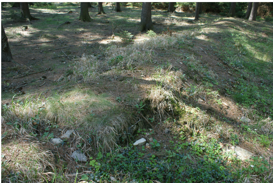
Homestead Nr. 14, walls.