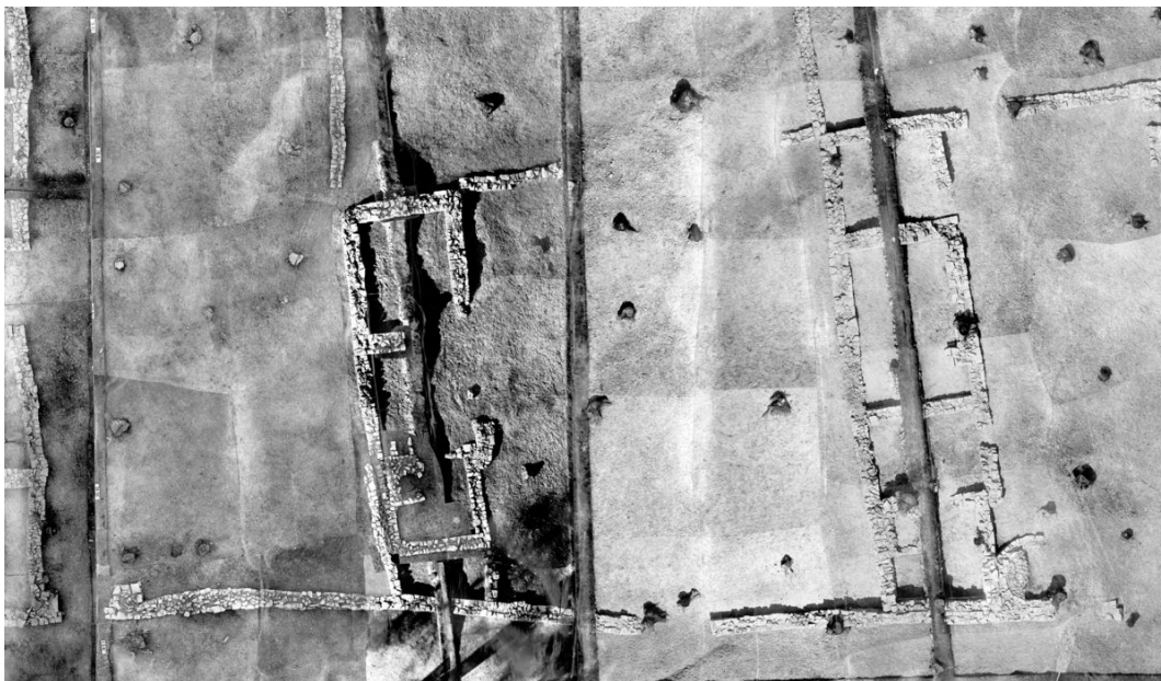
Photoplan of houses Nos. 1 and 2 during archaeological field work.