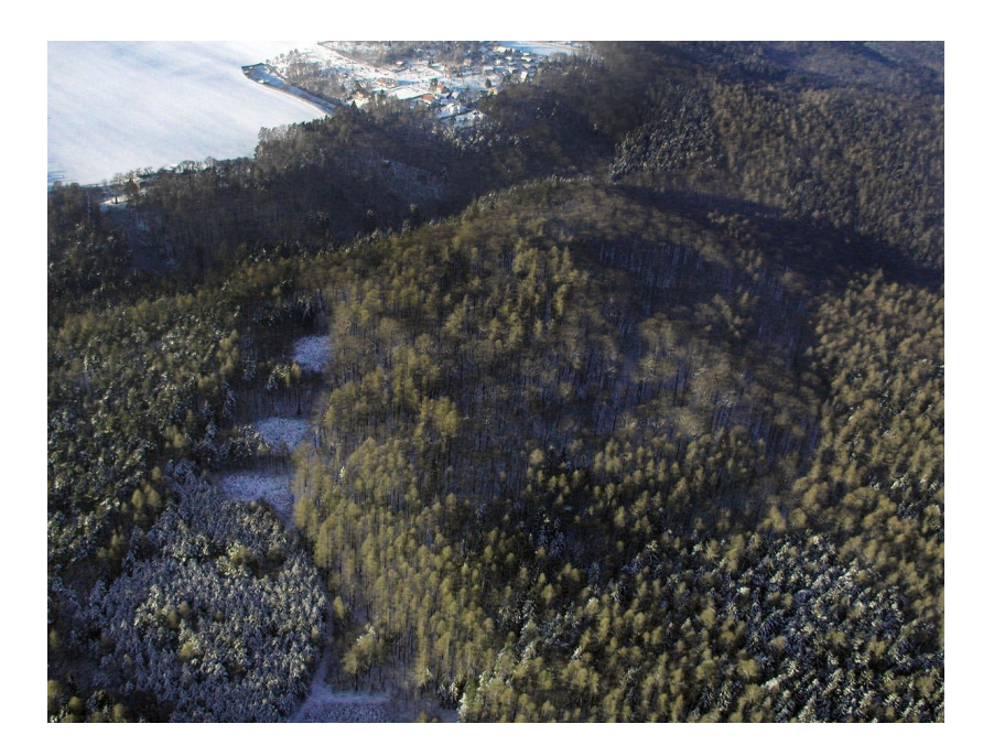
Aerial view of the hillfort. Photo M. Gojda, 2004.