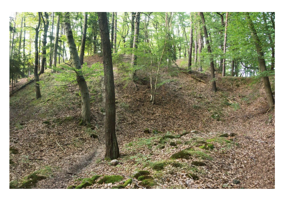
Surface relicts of Medieval small castle Šember, taken from the moat. Photo J. Mařík, 2014.