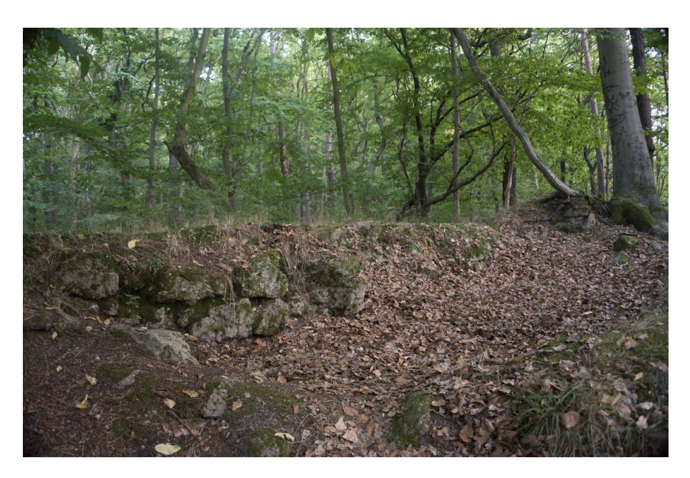
High Medieval Castle Šember and its walls.