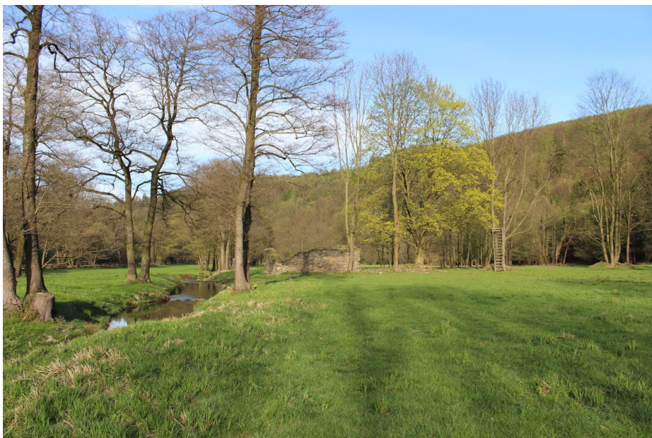
Remains of the Rozsocháčský mill with mill race.