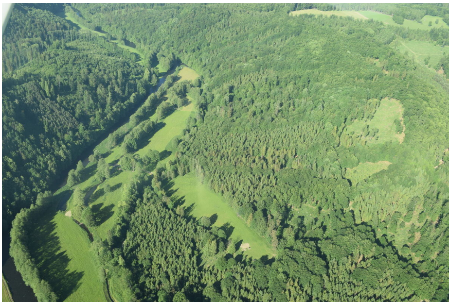
The Moravice River valley with visible mill race.