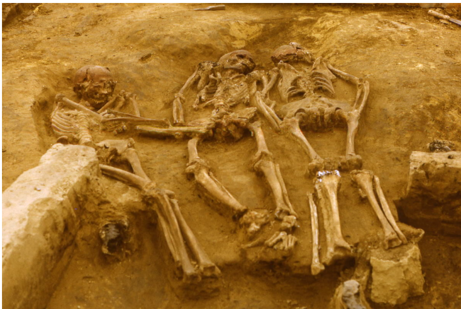
Dolní Věstonice II: triple burial excavated in 1986.