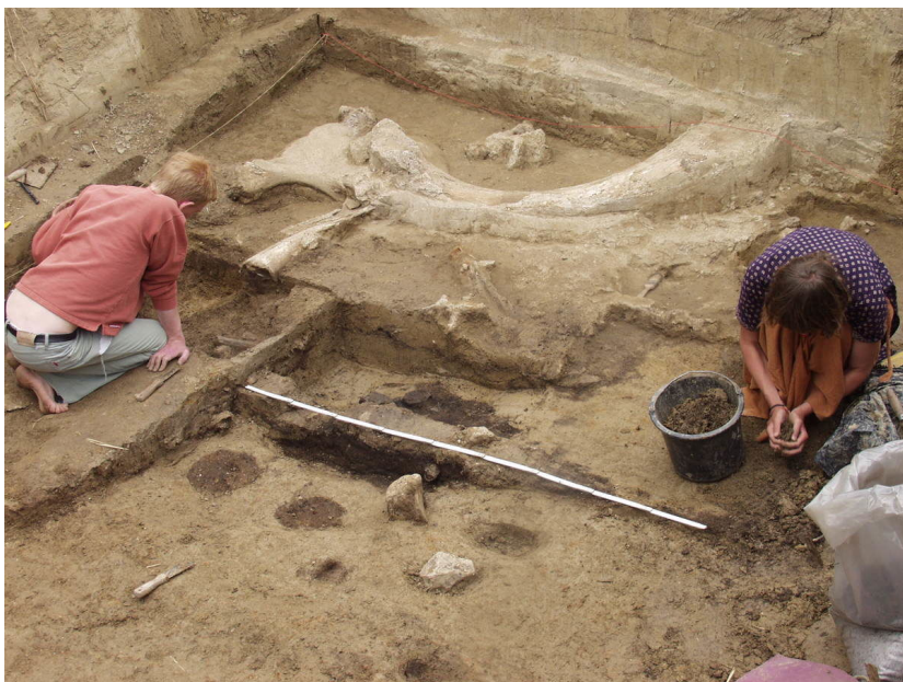
Archaeological excavations in Dolní Věstonice.