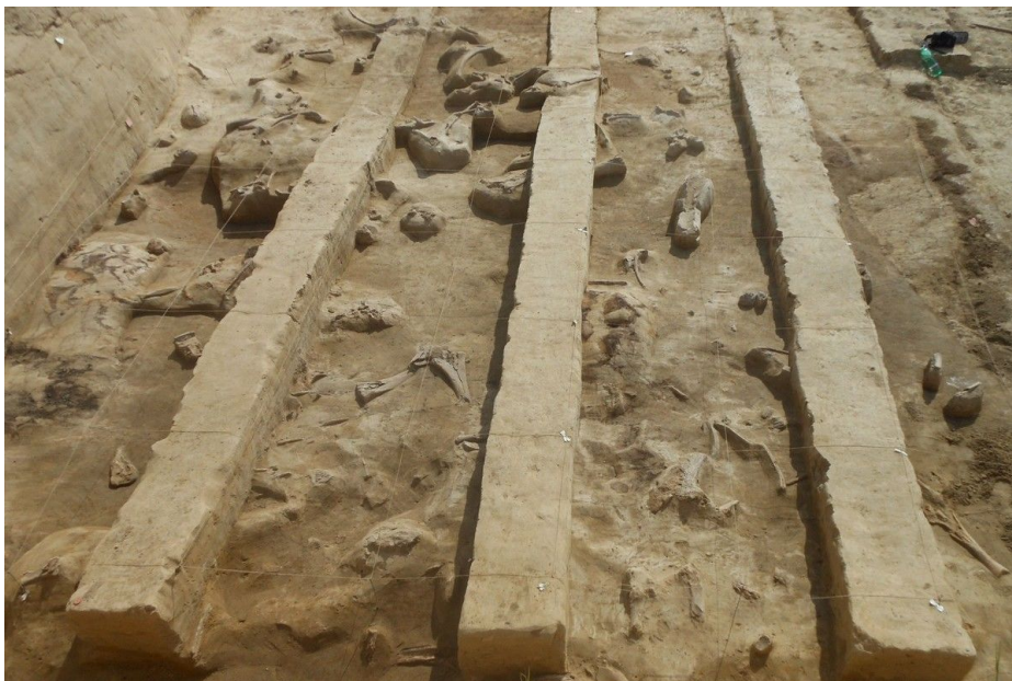
Dump of mammoth and other animal bones presented in situ, in the underground museum of Pavlov. Photo R. Stránská, 2015.