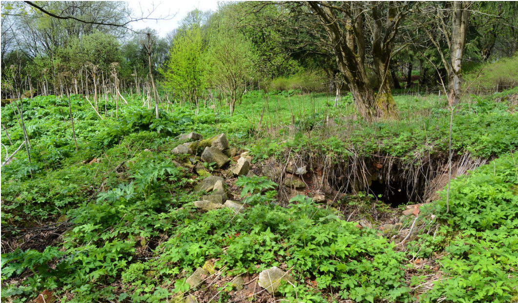
Remains of a house (Lauterbach).