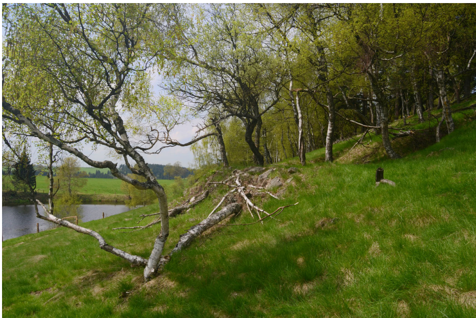
Mouth of a mining shaft.