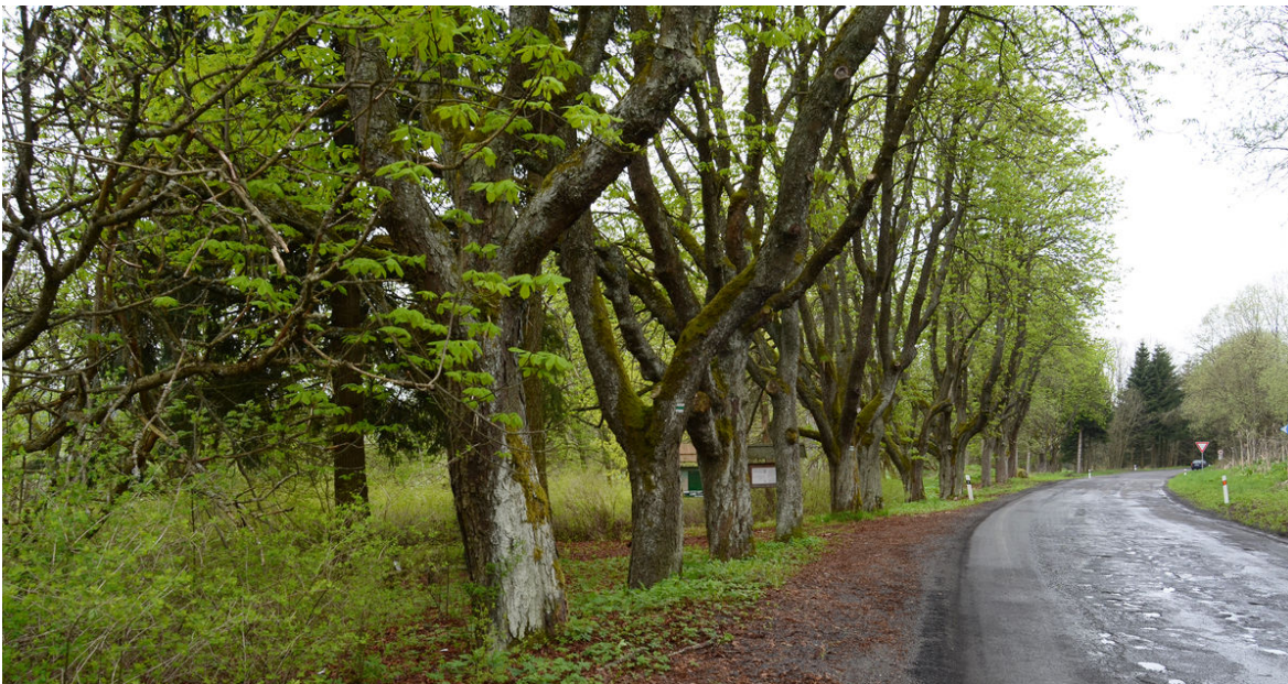
Alley in the northern part of the previous square (Lauterbach).