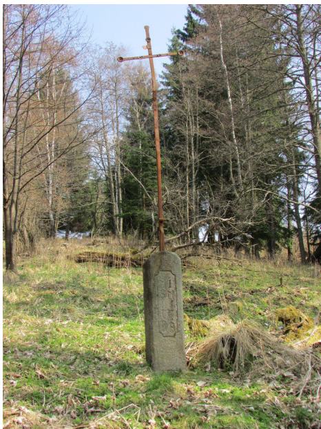
Cross near one of the deserted mills.