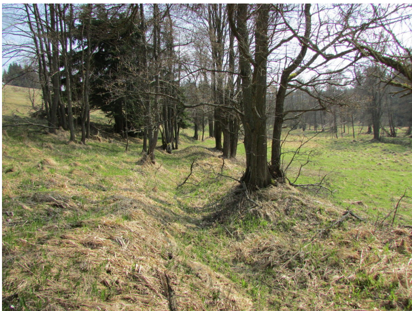
Race of a deserted mill.