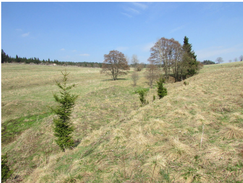
Mouth of St. Barbora shaft.