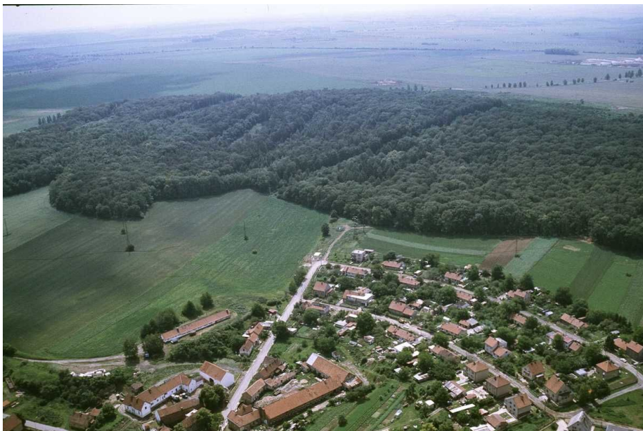
Chýnovský grove, aerial view.