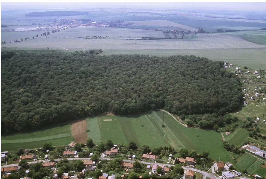
Chýnovský grove, aerial view.