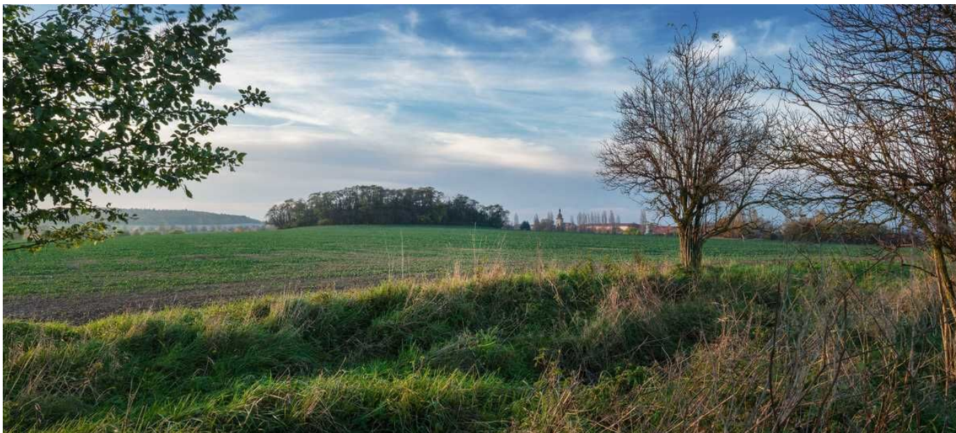
Tursko, 'Krliš' hill; forest 'Ers' in the background (left).