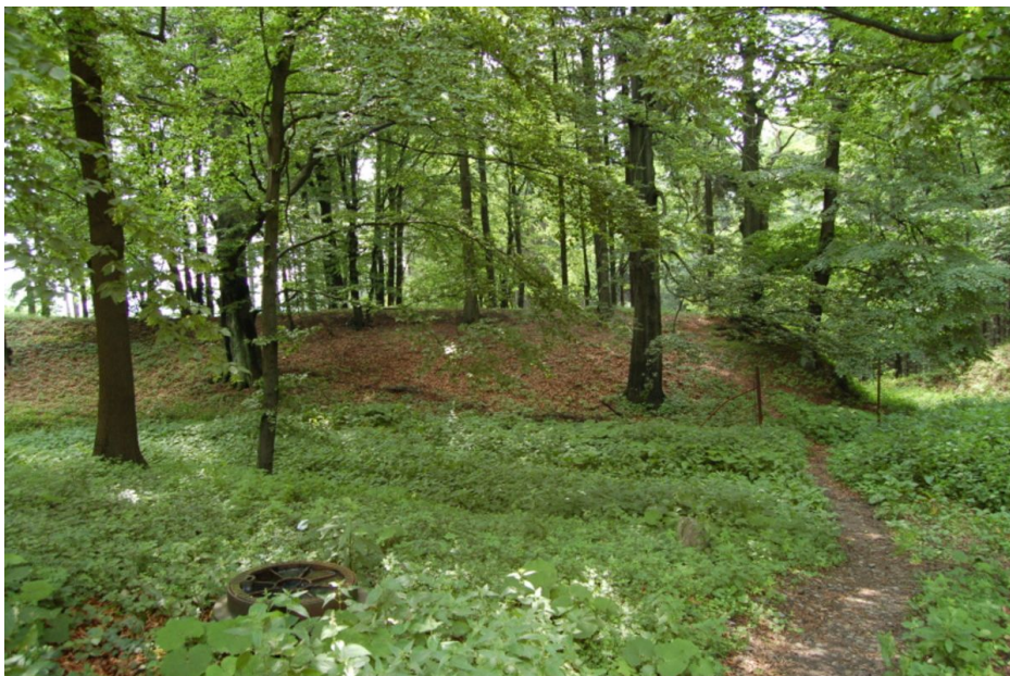
The earthwork in the south-east part of the hillfort; seen from the north. Photo P. Vachůt, 2007.