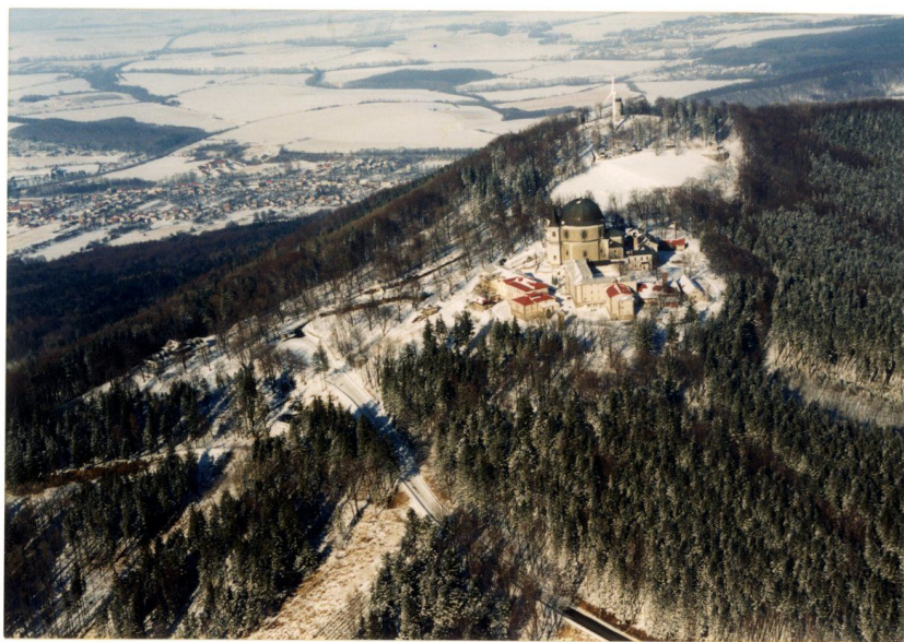
View from the south. Photo M. Bálek, 2003.