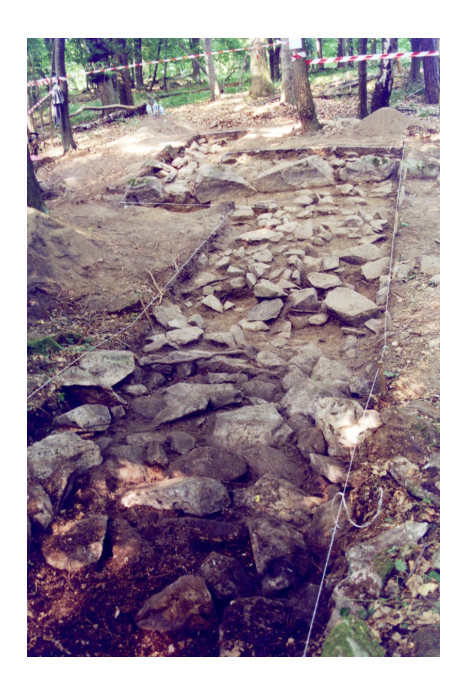
Foundations of the inner bank and edge of the third fortification belt (stone wall).