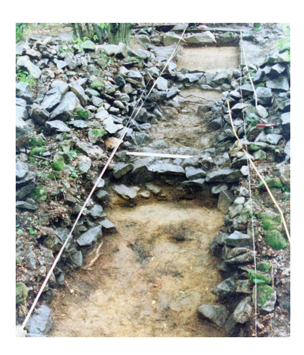
Foundations of the inner bank, eastern side.