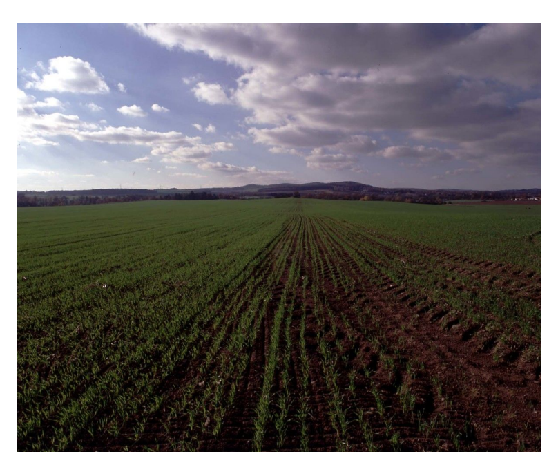
Panoramatic picture of the hillfort, taken from east.