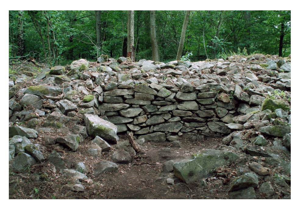
Inner stone wall in the western bank.