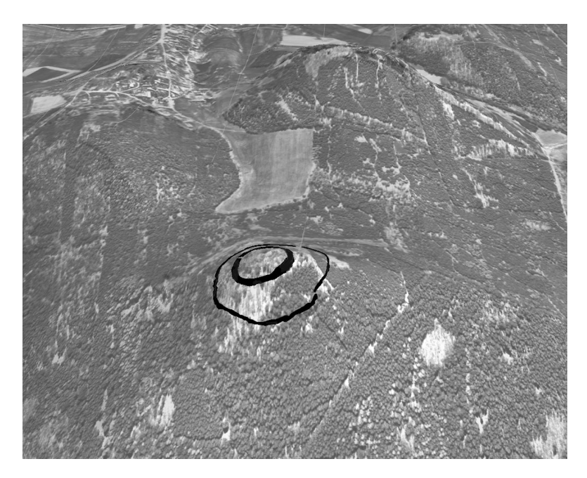
Plan of the hillfort on a orthophotography. Processed by Č. Čisecký.