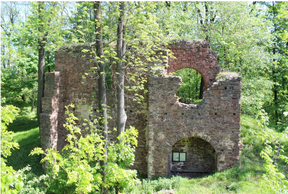
Remains of the walls of the residential quarters from the Renaissance residential building from the south-west.