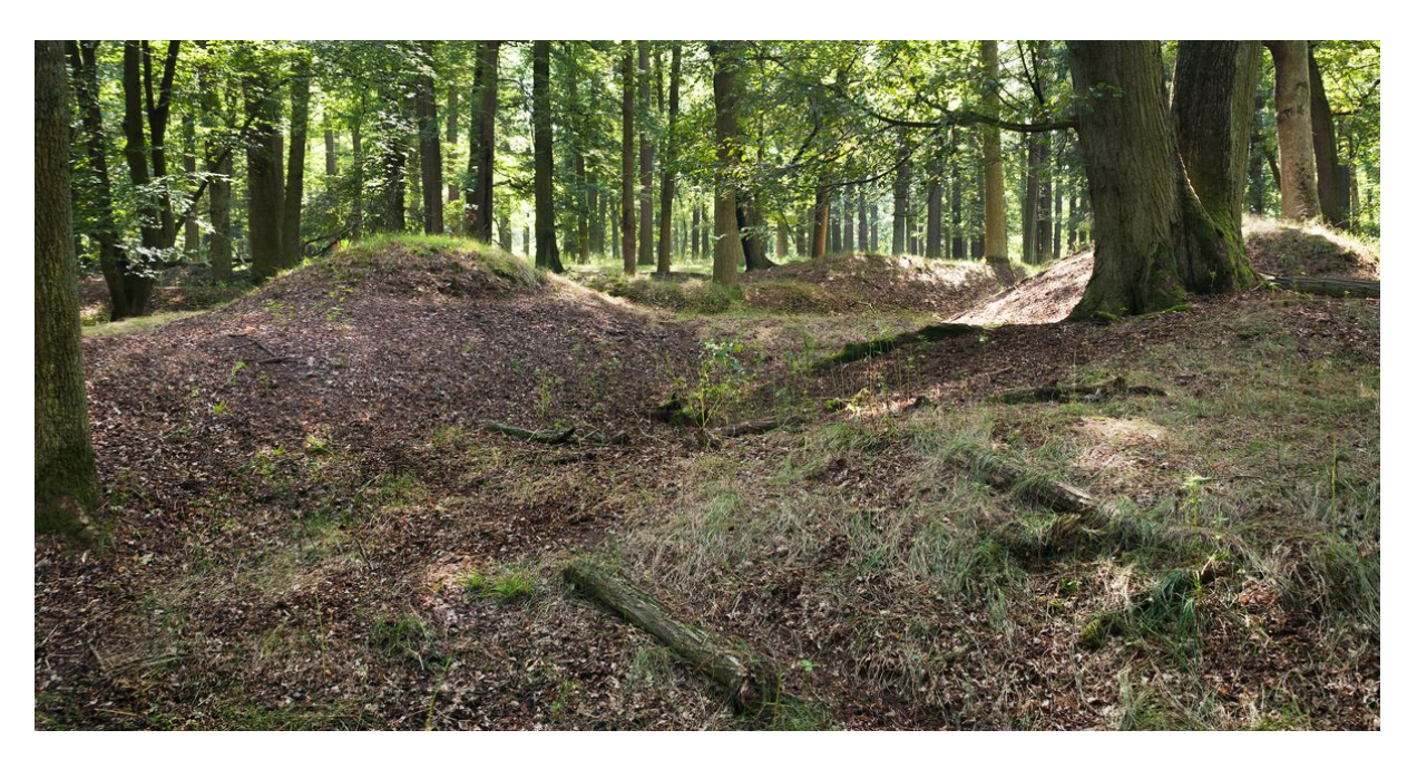
Spoil heaps in the chateau park.