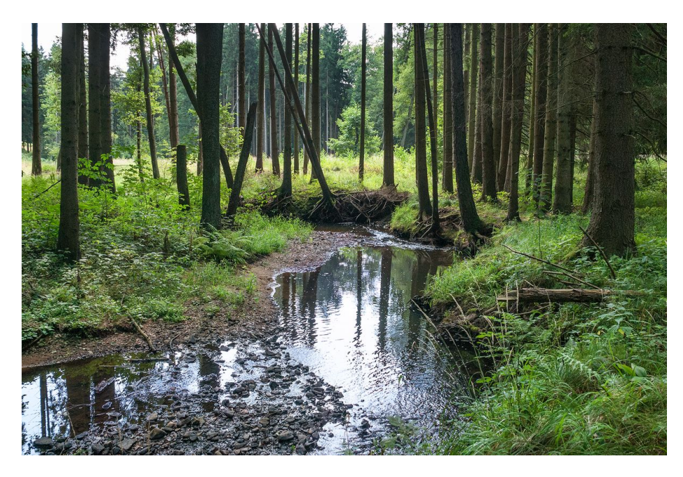
Závišínský stream with surrounding spoil heaps.