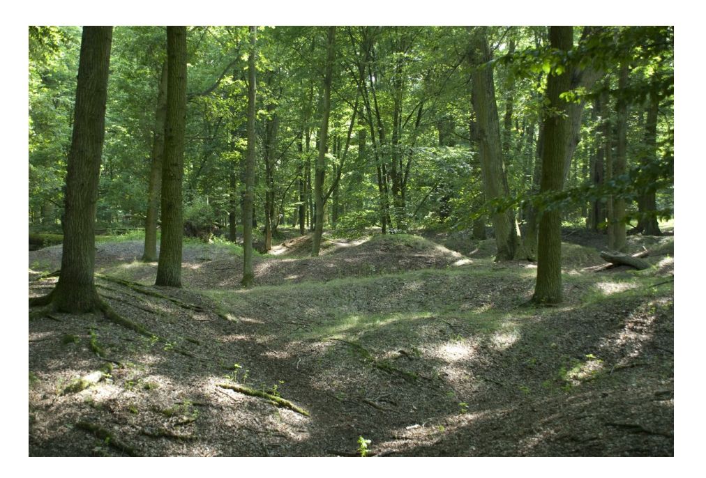
Spoil heaps in the chateau park.