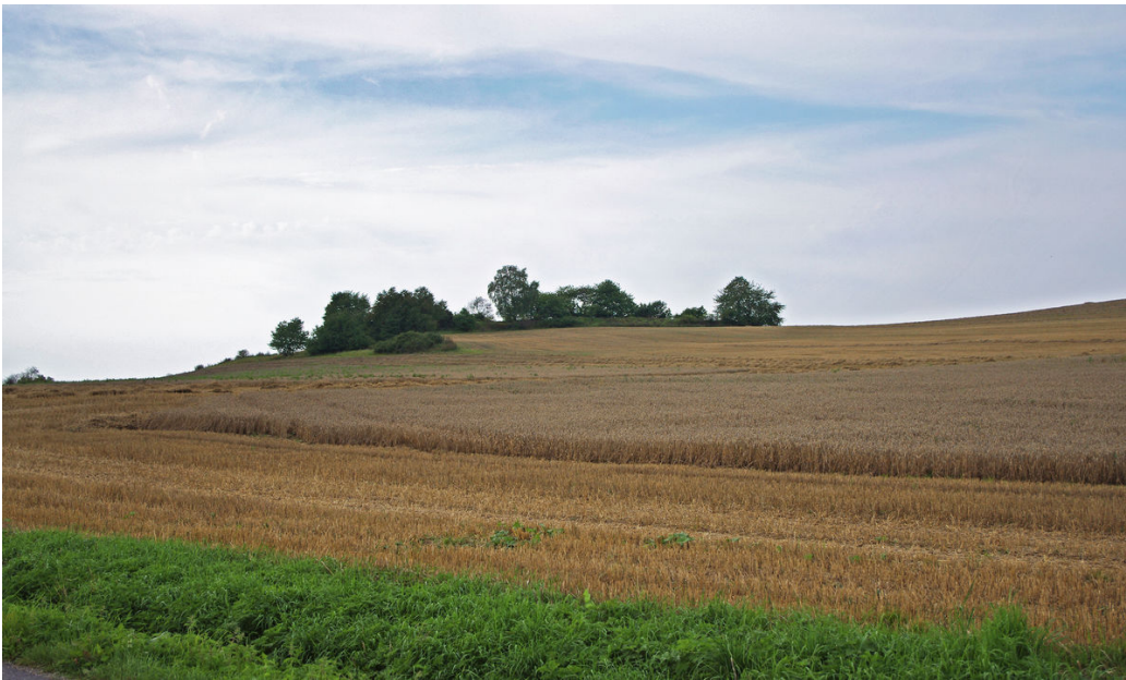
View from southeast in late summer.