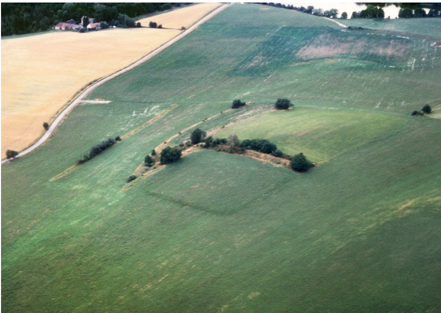
Aerial view with the so-called crop marks.