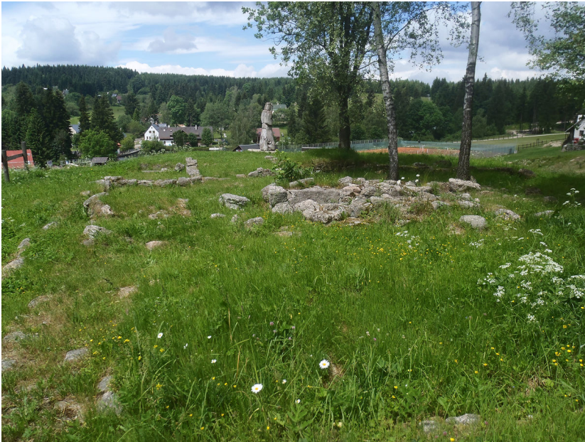
An overall view of the site from east.