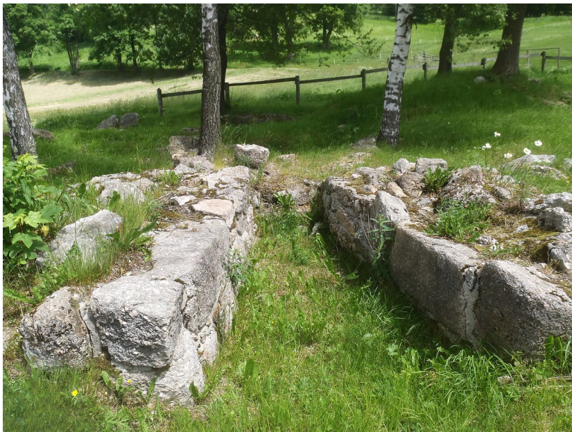
Central smelting furnace from south.