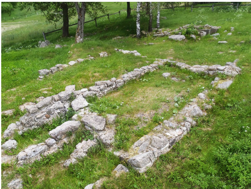
Foundations of subsidiary furnaces of the glasswork.