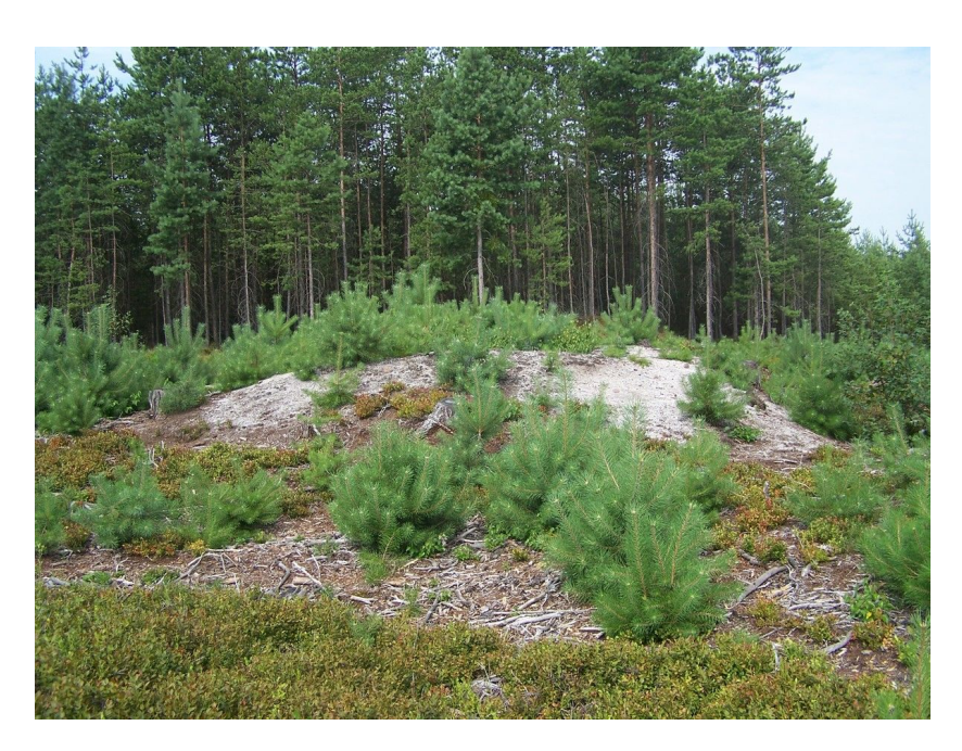
A barrow with renewed forest.