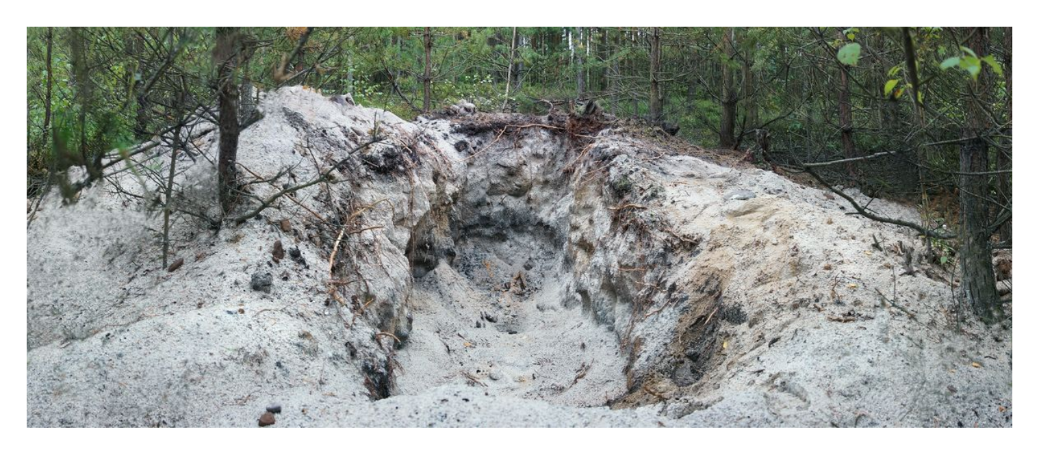
Barrow Nr. 28, destroyed by illegal excavations. Photo J. Mařík, 2014.