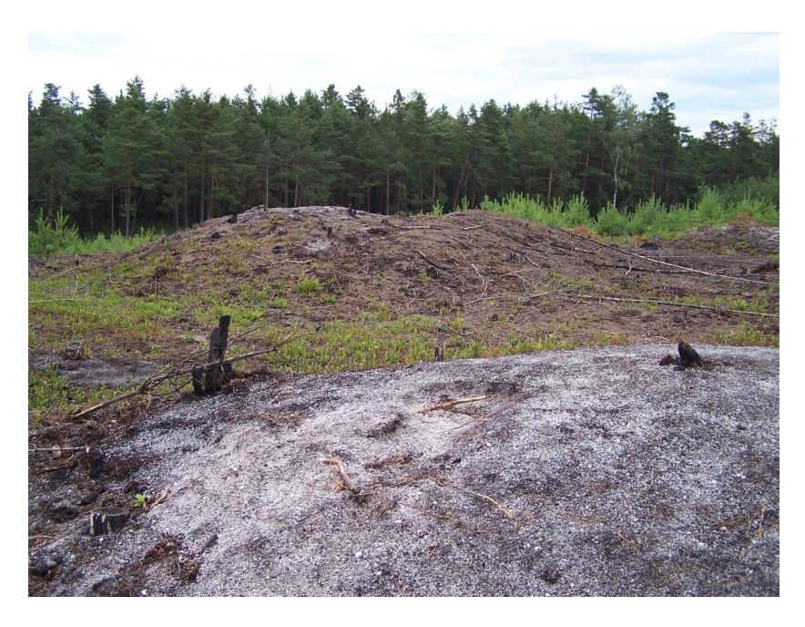
A barrow after forest fire. Photo P. Menšík, 2008.