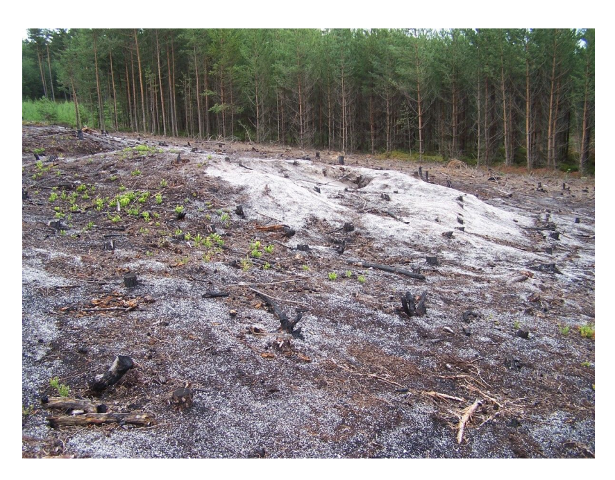
A barrow after forest fire. Photo P. Menšík, 2008.