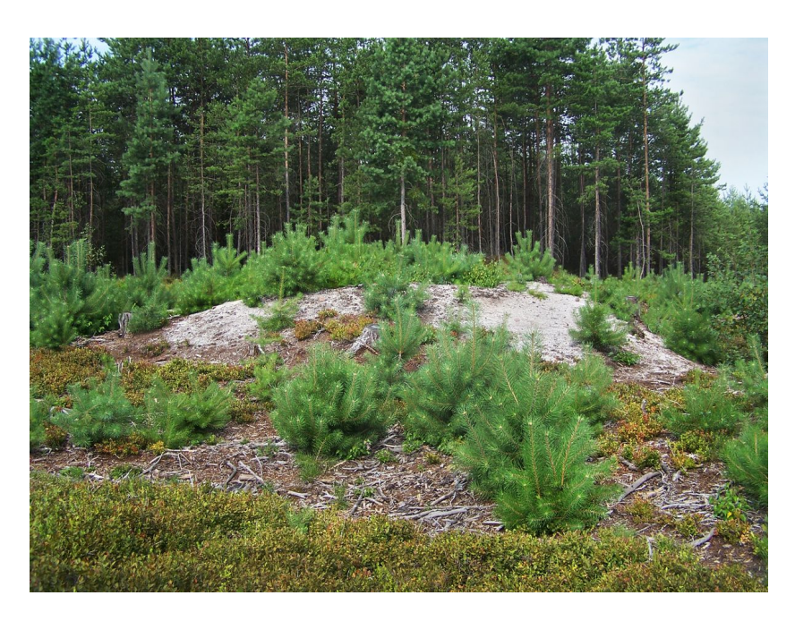
A barrow with renewed forest.