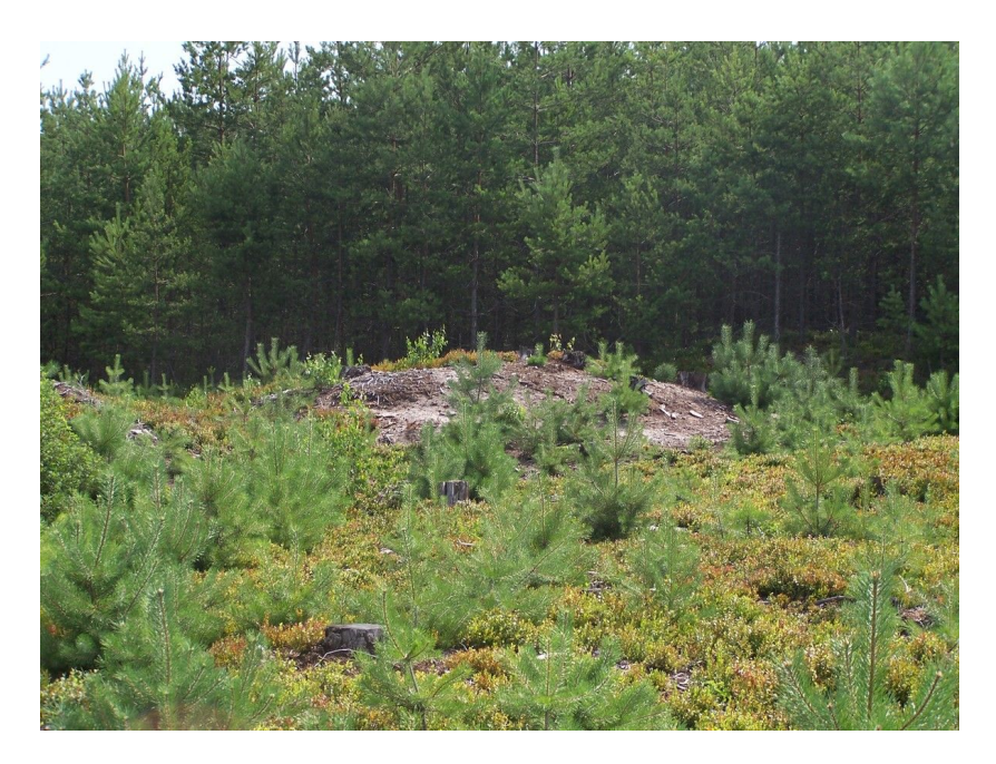
A barrow with renewed forest.