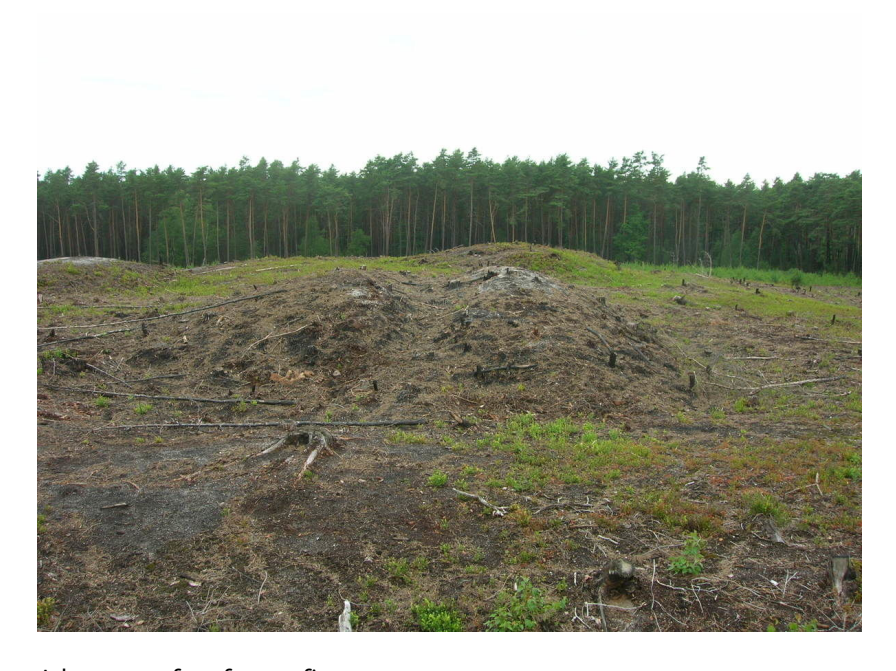
A barrow after forest fire.