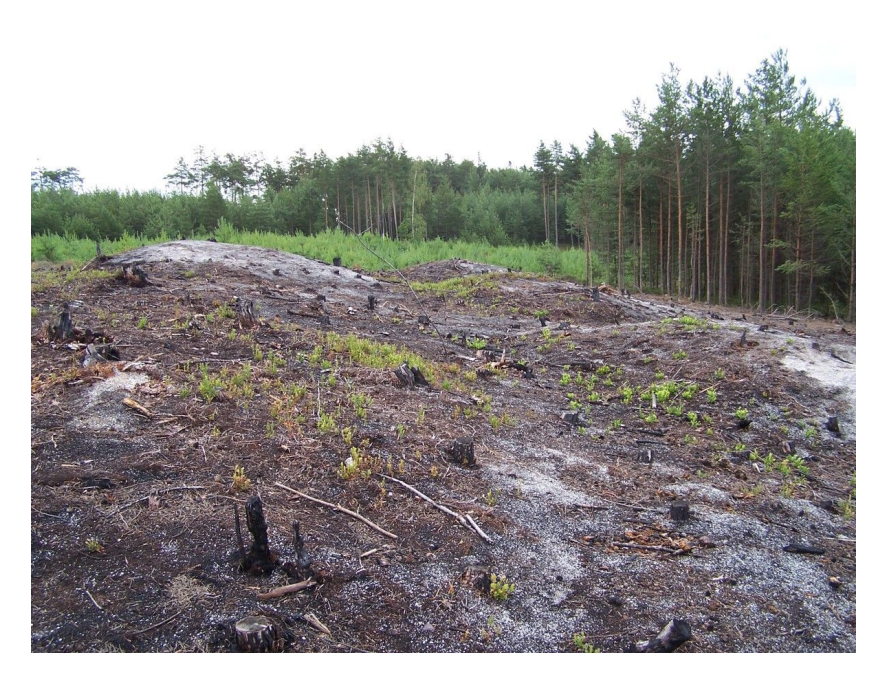
A barrow after forest fire. Photo P. Menšík, 2008.